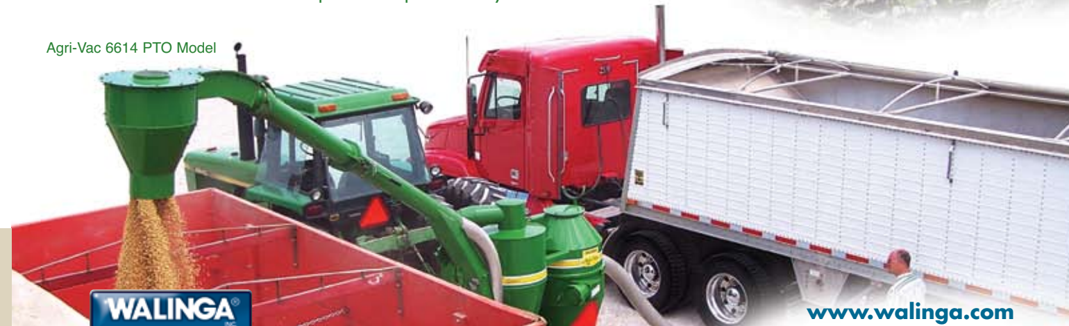
Agri-Vac 6614 PTO Model