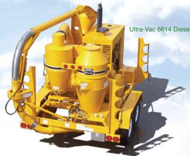
Ultra-Vac 6614 Diesel

At Walinga, we manufacture a full line of pneumatic conveying systems. With capacities ranging from 500bu/hr to 5800bu/hr, you're sure to find the right system to suit your needs!