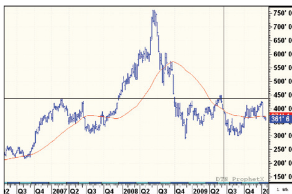
Corn: weekly futures chart

The fear fed on itself. Corn plunged 60%; in a week, soybeans fell $1.40 in two weeks; and wheat dropped by 90%. Price charts turned negative, fueling further selling by speculators. Producers slammed the bin doors shut, and end-users stepped in to buy at the cheapest levels they had seen in many months.